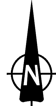
SIGN REF 1