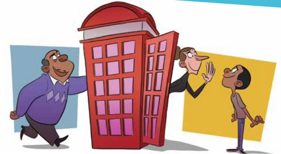
WE WILL ALWAYS TELL YOU WHEN YOUR SOCIAL WORKER IS CHANGING.