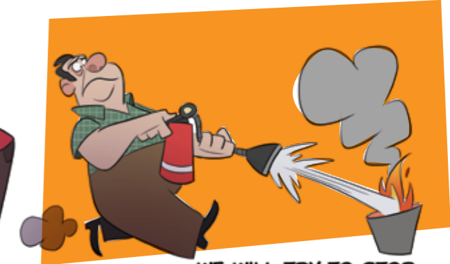
WE WILL TRY TO STOP ISSUES ESCALATING.