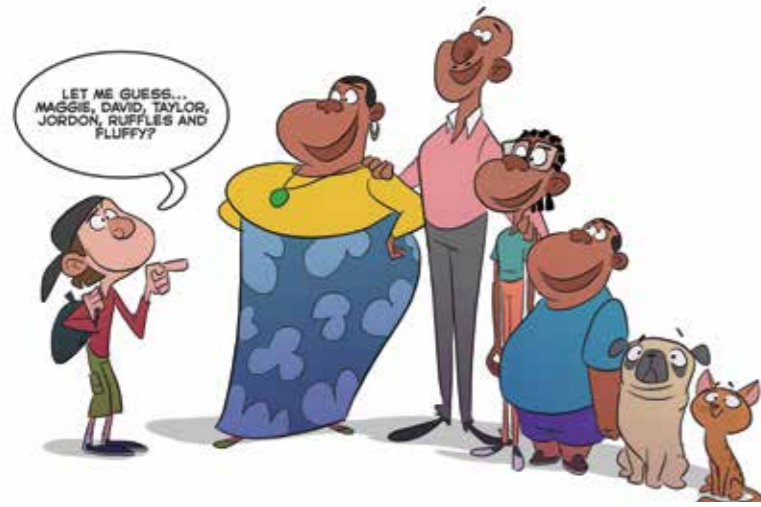
WE WILL GIVE YOU INFORMATION ABOUT ALL YOUR PLACEMENTS IN ADVANCE (THIS WILL INCLUDE: NAME OF CARERS, DETAILS AND AGES OF OTHER YOUNG PEOPLE, THE PLACE, PETS, ETC.)