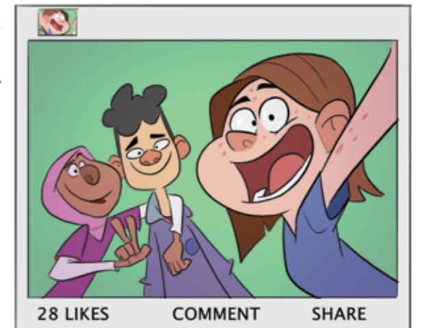
WE WILL SUPPORT YOUR RELATIONSHIP WITH YOUR FRIENDS.