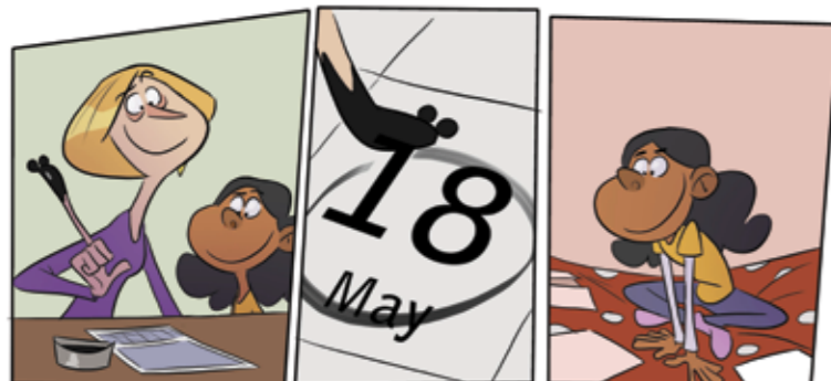
WE WILL TELL YOU WHY YOU ARE MOVING/ WE WILL INVOLVE YOU IN THE MOVE.