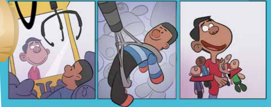
WE WILL VALUE YOUR FAMILY RELATIONSHIPS.

To find out more about the Magna Charter and what you can do if you think something is changing for you, see: www.southtyneside.gov.uk/magnacharter