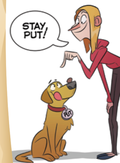
WE WILL PROACTIVELY SUPPORT AND PROMOTE 'STAYING PUT'.