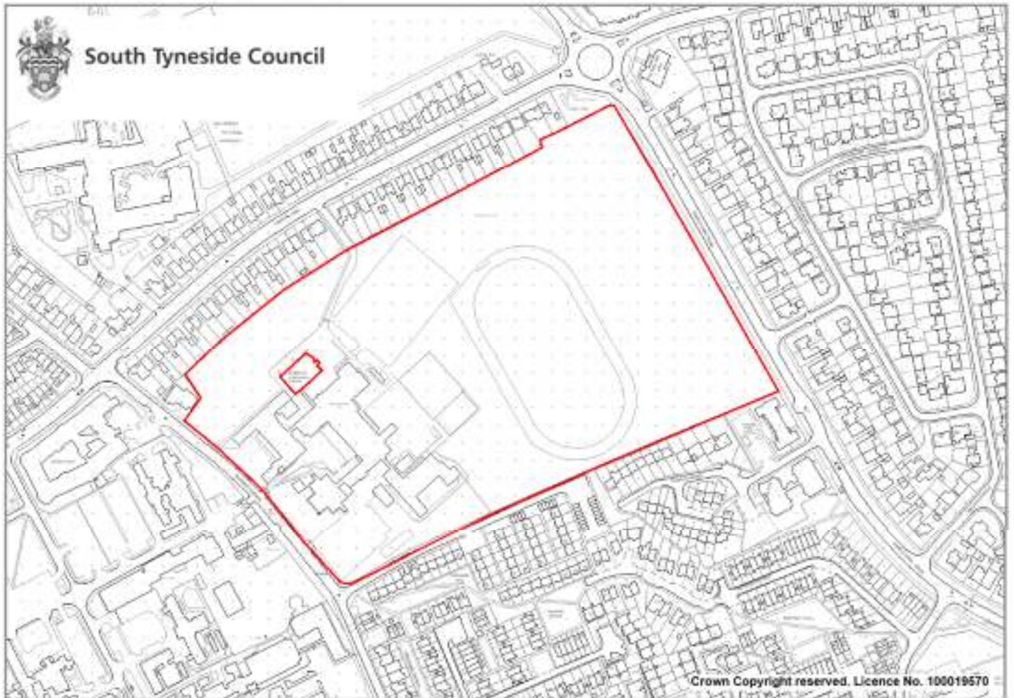
Appendix 1: Site boundary - The Playing fields, grounds and associated lands on the site formerly occupied by Brinkburn School