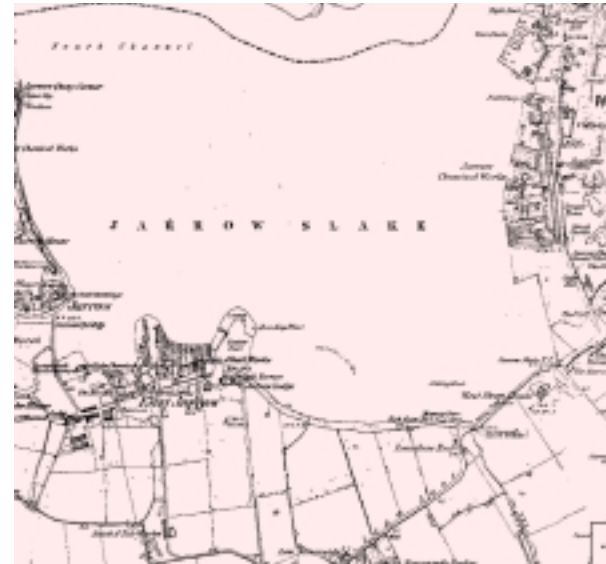
JARROW IN 1862

Jarrow Slake, originally 'Jarrow's Lake', was once a sheltered