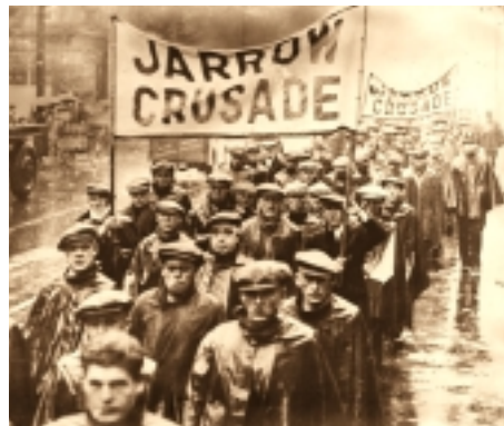
THE FAMOUS JARROW MARCH OF 1936

For a slightly longer route, turn left into Ferry Road towards the River. At Chaytor Street turn right. On your left is Jarrow Riverside Park . The park provides access to the Pedestrian Tyne Tunnel , which allows you to cross the Tyne to Howdon and is worth a visit if you have not been before. It was opened in 1951 and consists of two parallel tunnels, each 300 yards long - one for pedestrians and one for cyclists. The escalators are 186 feet long, the world's longest wooden escalators at the time - a record they still hold.