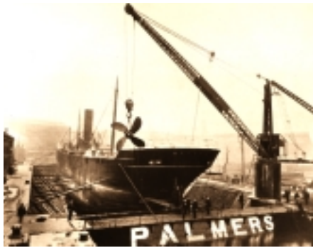
THE 'BATOUM', LAUNCHED 1893, IN PALMERS YARD