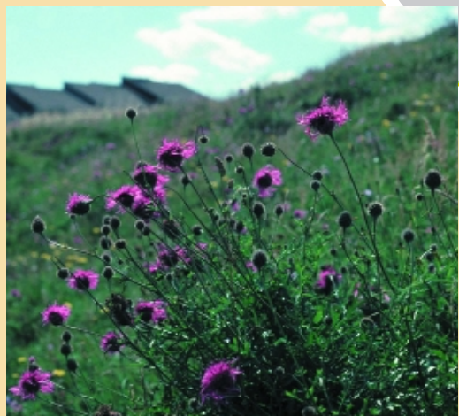
GREATER KNAPWEED, HARTON DOWNHILL

ACCESS There is a good path all the way along the coast, but the cliffs can be dangerous so keep well away from the edge. Marsden Sands can be reached via a steep slope and/or flight of steps. If you venture onto the shore, make sure you are not endangered by rising tides.